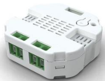
Aeon labs Aeotec Micro Switch G2

heatapp! single floor is a switchable radio outlet or alternatively an concealed switch relay to the circuit of electric heating appliances, for example infrared heatings or fan heater. There are three variations of Z-Wave products from free trade, recommended by EbV heatapp! single floor . These devices are heatapp! checked and can be integrated in heatapp! systems. (Relation about specialised trade!)