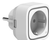
Aeon labs Aeotec Smart Switch 6